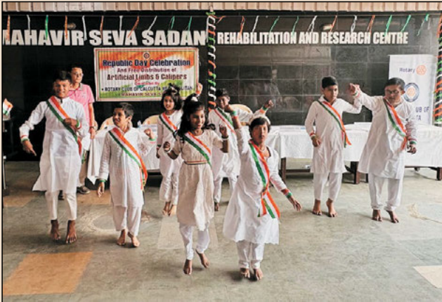
Cerebral Palsy Children presenting the dance on Nation