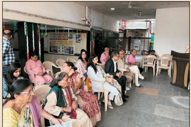
Metropolitans and MSS members in attendance