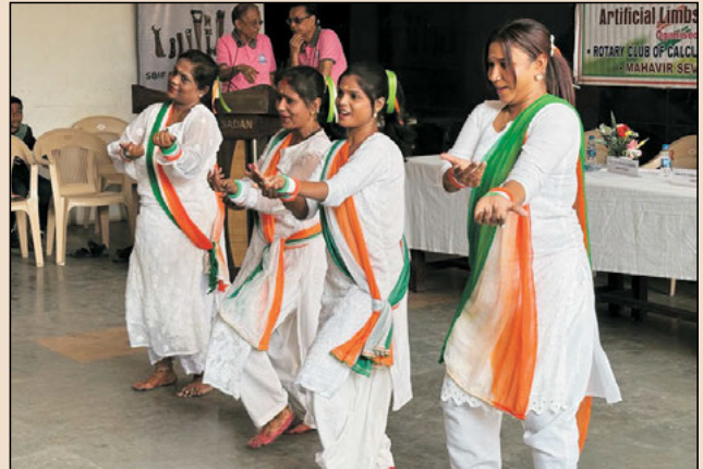
Another view of Cerebral Palsy Children dancing with National Songs