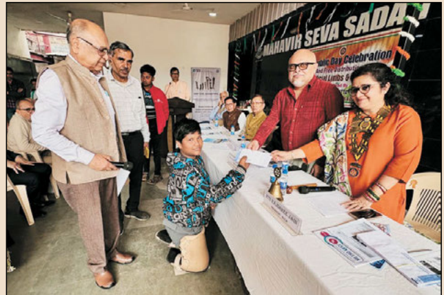
Another view of distribution of Scholarship & Artificial Limbs