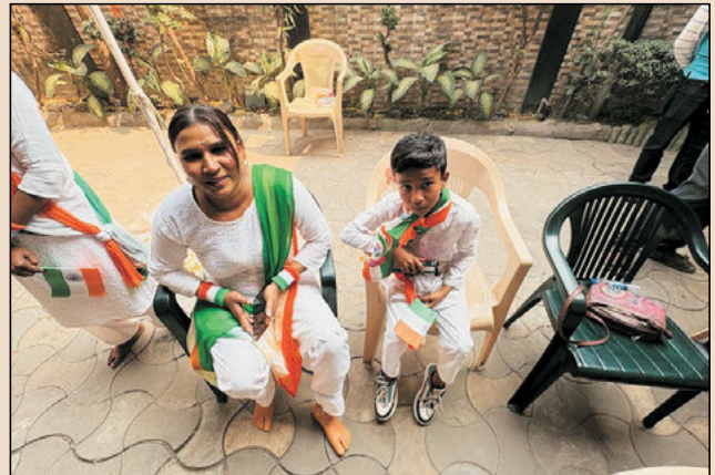
Another view of Choclates being provided