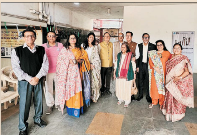
Metropolitans and Members of Mahavir Seva Sadan