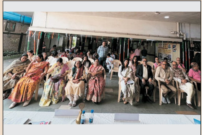
Full view of audience