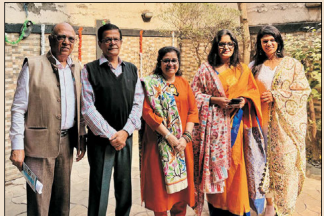
Metropolitans in attendance