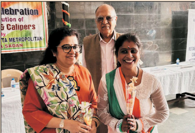
Cerebral Children teacher being felicitated