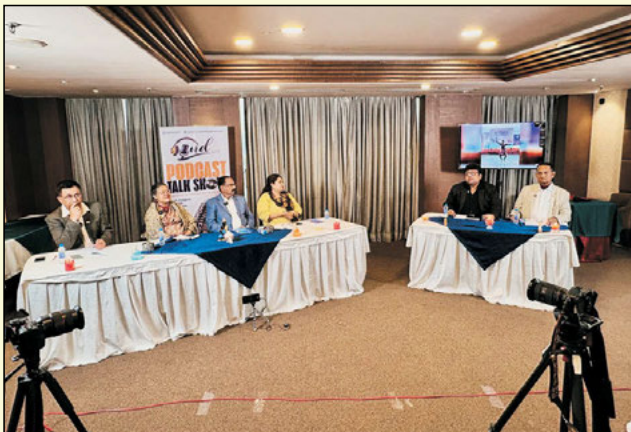
Session with RYLA team