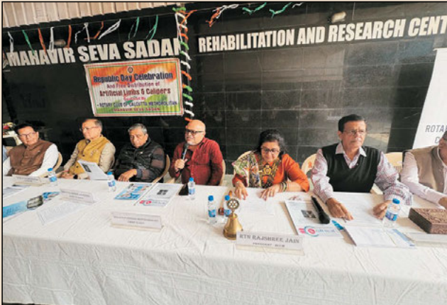
Another of DGN in his address with full view of Head table