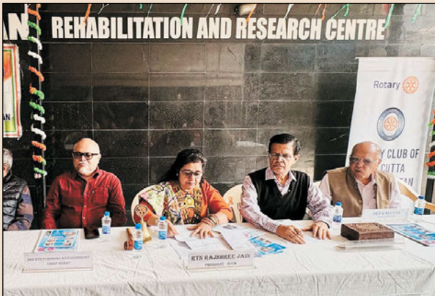
A view of Head table