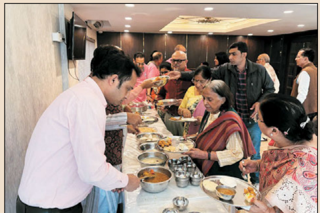
South Indian Breakfast before the start of meeting