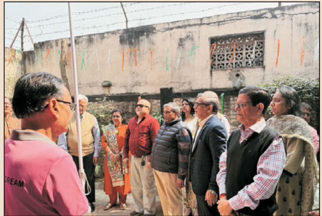
Hoisting of National Flag